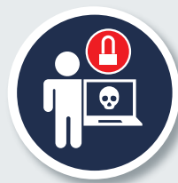
Antivirus & Antispam