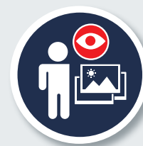
Data Protection and Image Control

If you have any questions about Email Encryption or want to know more about our other services, please call our sales team on 0800 640 8009